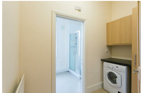
GROUND FLOOR 45 sq.ft. (3.9 sq.m.) approx.

Available Immediately | £925pcm | Unfurnished | First Floor Flat | 710 Sq ft (65.9 m2) | Lounge | Two Double Bedrooms | Modern Kitchen | Shower Room WC | Utility/ Store Area | Great Central Gosforth Location | Private Rear Yard | On Street Parking | Close To Transport Links | GCH & DG | Council Tax Band: A | EPC Rating: D